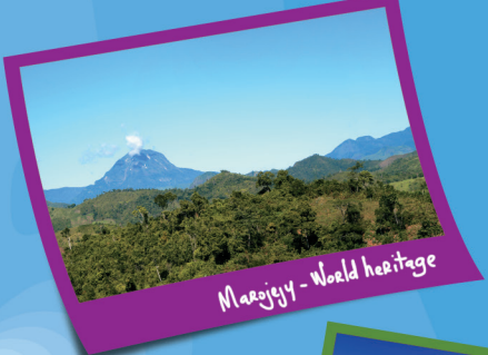
Marojejy - World heritage