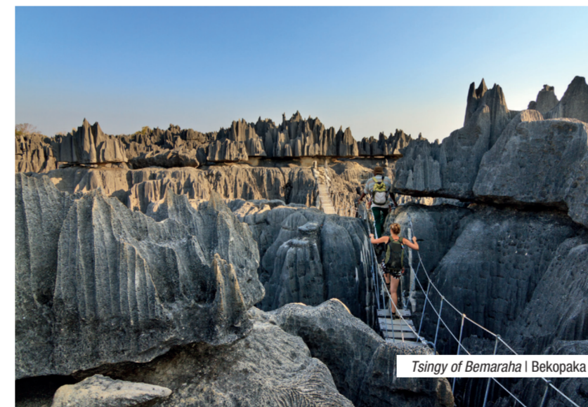
Tsingy of Bemaraha | Bekopaka

All go through a Tsingy, a unique, spectacular mineral treasure, a giant maze, geological souvenirs of ancient erosion.