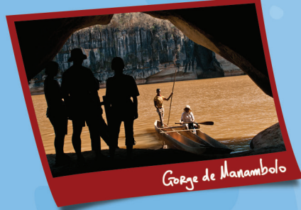
Gorge de Marombo