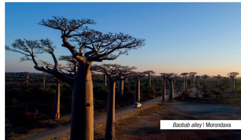
Baobab alley | Morondava