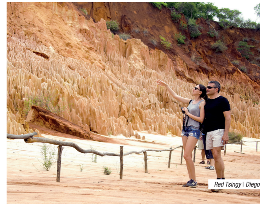
Red Tsingy | Diego