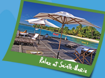
Relax at Sainte-Marie