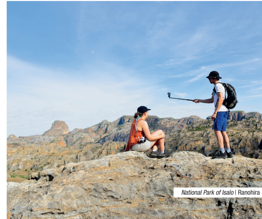
National Park of Isalo | Ranohira

Some will leave from Cap d'Ambre and trek down to the deep south, as far as Cap St. Marie ... Over 1,600 km of unforgettable adventures.