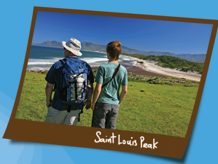
Saint Louis Peak